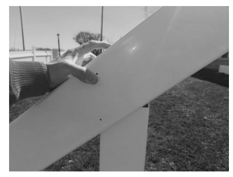
STEP 4 INSTALL ARM Instalar el brazo