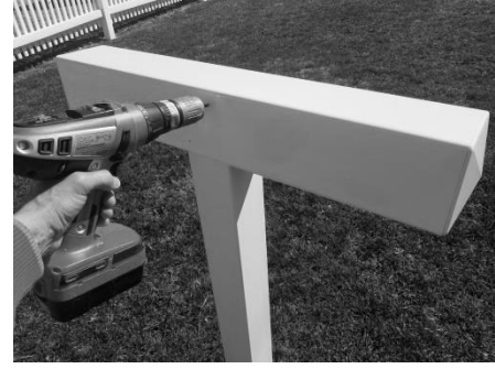
STEP 6 SECURE ARM Brazo de forma segura