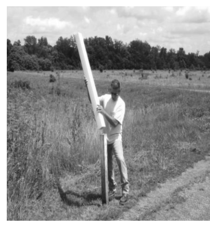
STEP 2 SLIDE VERTICAL SLEEVE Slide vertical en manga