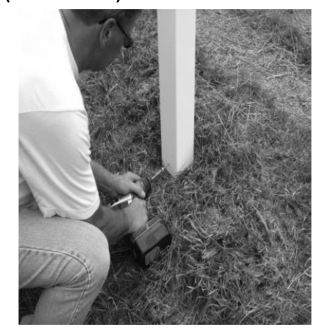
STEP 3 SECURE VERTICAL SLEEVE Asegure vertical en manga