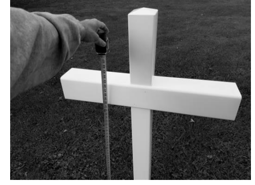
STEP 5 MEASURE LOCATION Medida de ubicación