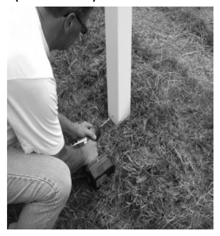
STEP 3 SECURE VERTICAL SLEEVE Asegure vertical en manga