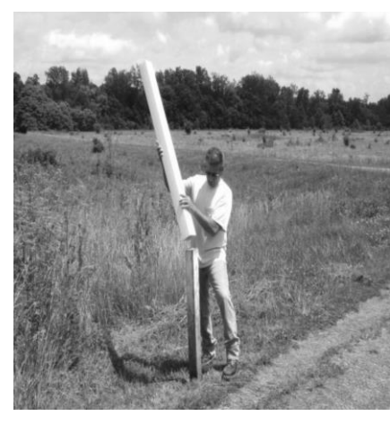
STEP 2 SLIDE VERTICAL SLEEVE Slide vertical en manga