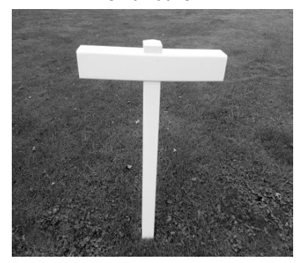
STEP 4 INSTALL ARM Instalar el brazo