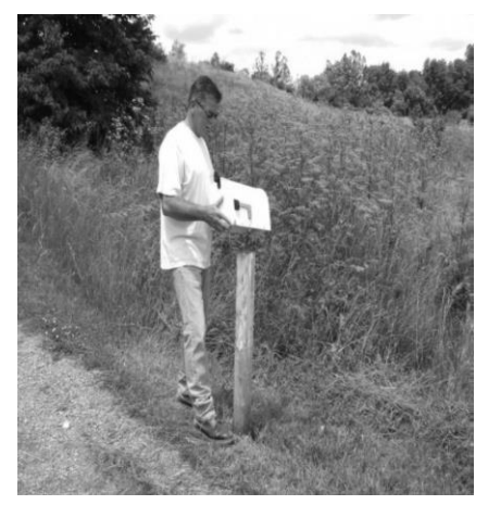
STEP 1 REMOVE MAILBOXES Borrar buzon